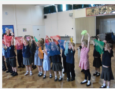
Art Attack class participating in Circus Skills on Circus day

We are all very proud of the children and our community after our recent Ofsted report . We are now well on our way to becoming officially good, so I would like to say thank you to everyone who has supported the school over the last 3 years.